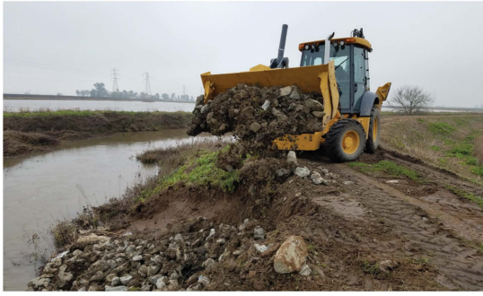
Repairing a slip in the levee in the Pleasant Grove area