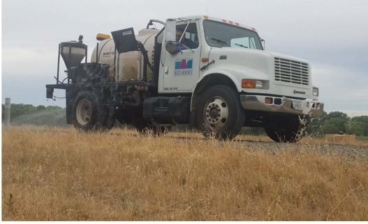
Spraying tumble weeds and star thistle along Garden Highway