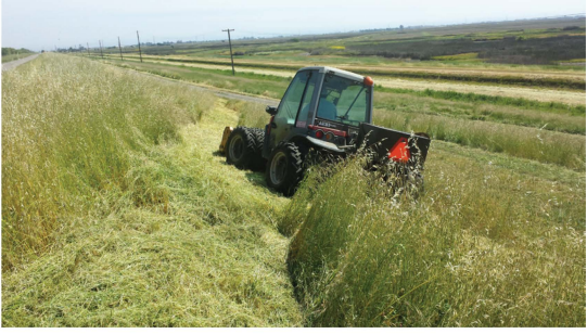
Mowing on Natomas Cross Canal