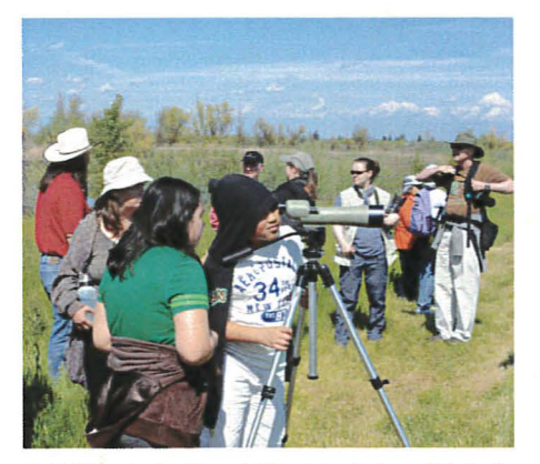
Activities during Creek Week include a "Birds & Bloom Tour" of the Bufferlands